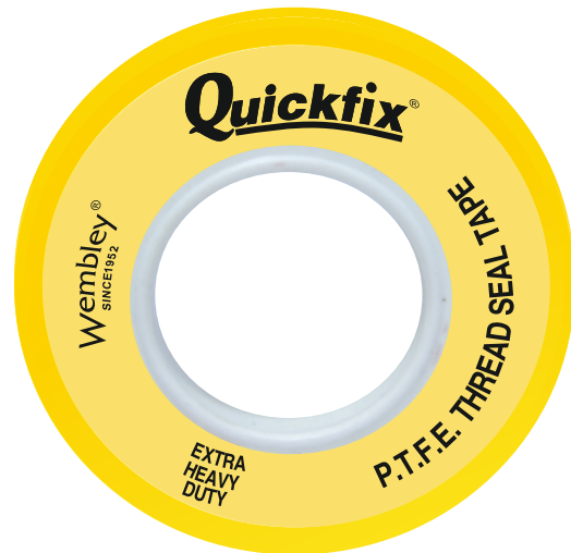
Extra Heavy Duty